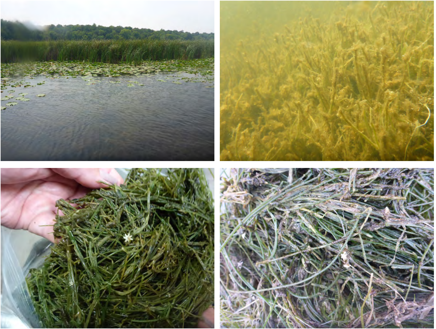
Figure 2. [top-left] SSW appears to be confined in a sheltered bay bordered by cattails and bulrush. [top-right] The beds of SSW are undisturbed and range in area from 4 sq ft to an estimated 1,500 sq ft. [bottom-left] SSW sample with a star bulbil. [bottom-right] A number of bulbils were observed in the SSW beds.