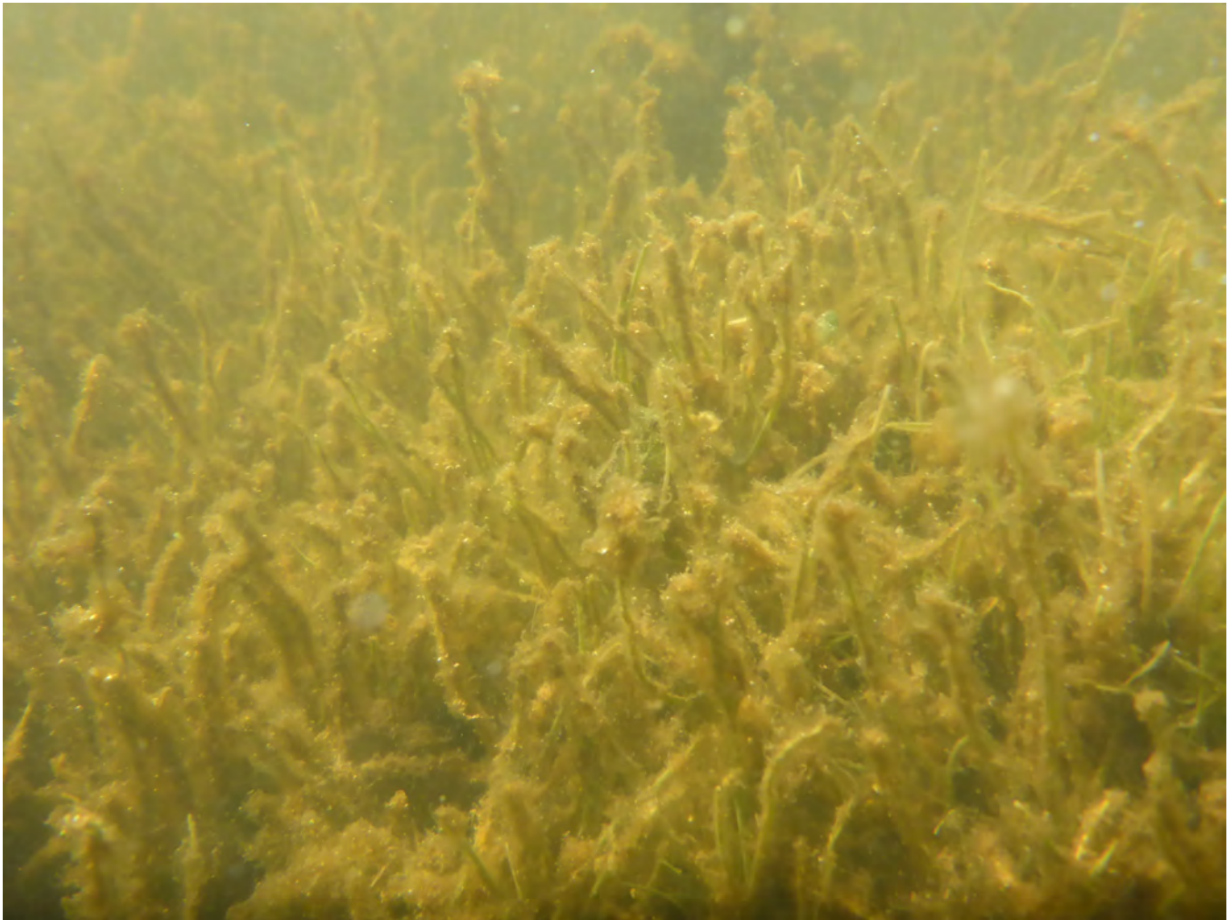
Bed of Starry Stonewort in Clearwater Lake, Wright County, Minnesota, on August 21, 2023