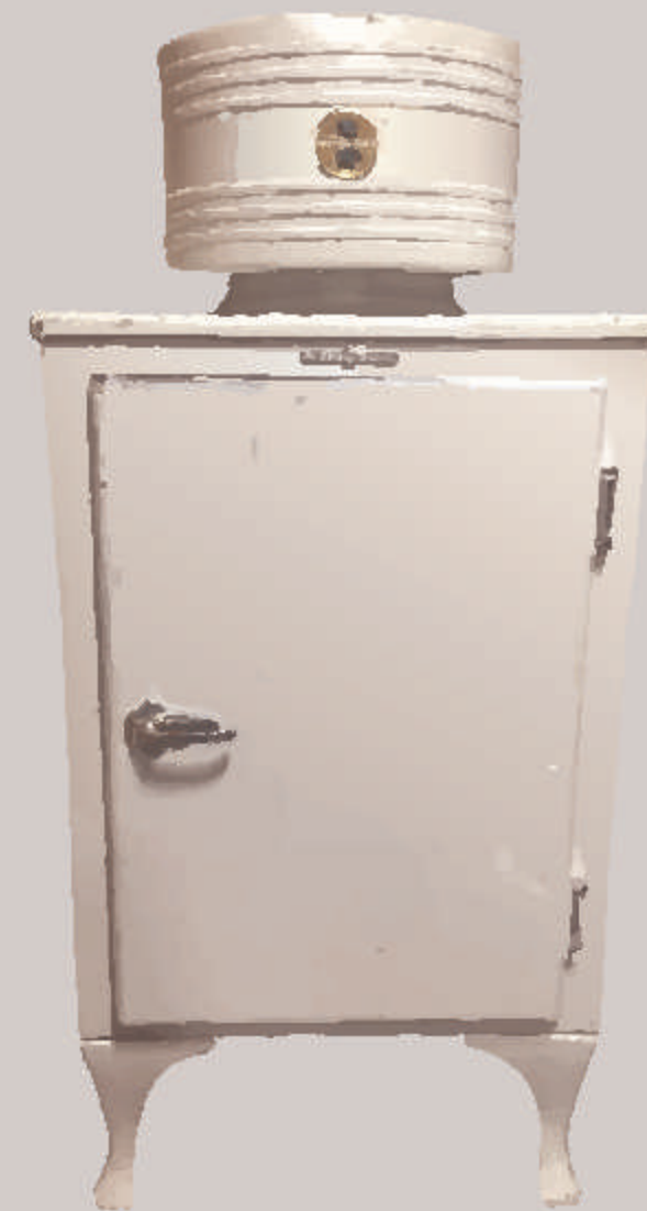
The 1930s General Electric refrigerator had a distinctive feature on top, known as the "Monitor Top". It was a condenser unit housing the compressor and condenser coils. Since the design resembled the gun turret of the Civil War ironclad ship USS Monitor, it became known as the "Monitor Top", a hallmark of General Electric's early refrigerators.