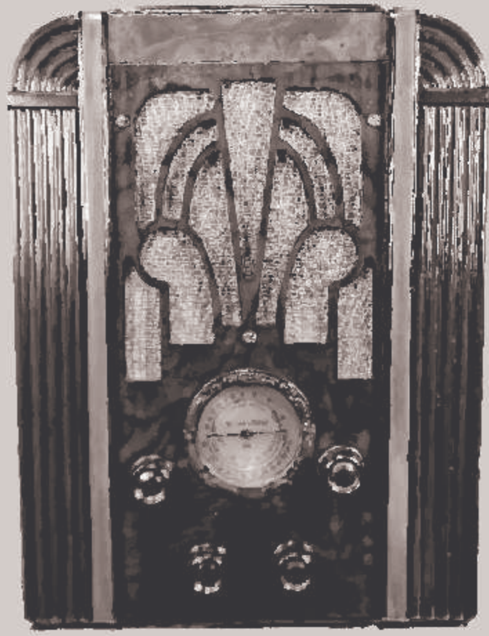
The Atwater Kent model 356 is an AM radio receiver produced in 1935 by the Atwater Kent Manufacturing Company in Philadelphia.

Well, it's March 4th and I'm sitting at my desk looking out the window at the lake. It's raining a bit, the snow is more or less gone, and the ice is beginning to soften and pull away from the shoreline. Overall this winter has been fairly dry and just a few cold spells. I'm looking forward to open water season!